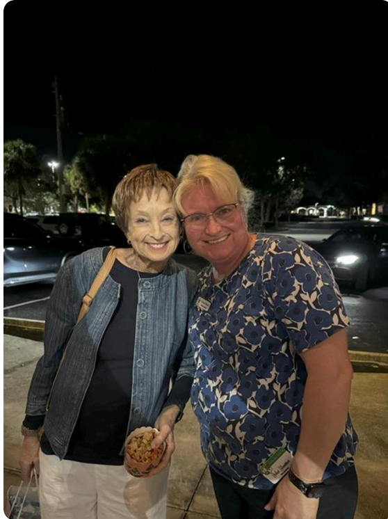
at Ives Sip and Shop for FMWCC