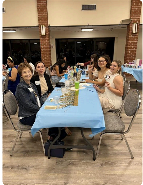
at November's Brushes and Bubbly FMWCC